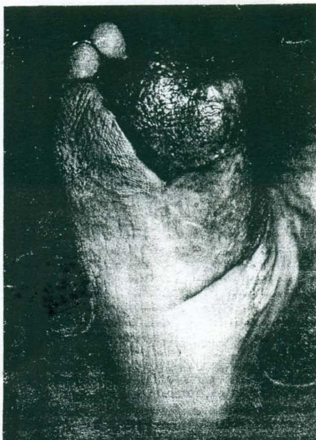
Figure 4. The final result (Case 1).