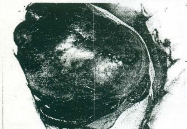
Figure 3. Leeches decongesting the degloved skin (Case 1).