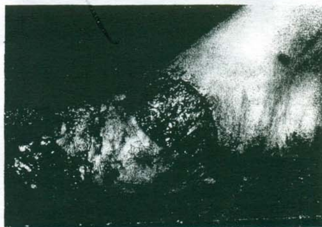
Figure 2. Extent of the degloving (Case 1).

At operation a limited wound excision was performed. The