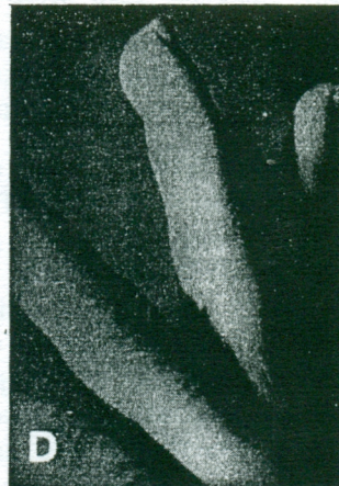
(Fig - 2) (A) Pre-operative photograph with the flap marked (B) Intra-operative photograph with the flap raised (C) 9 months follow-up, front view (D) 9 months follow-up, side view