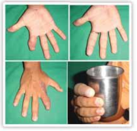
Cosmetically excellent and passively functional