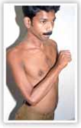
A young man with injury to the Brachial Plexus. After nerve grafting he has restoration of function. The unit has plans to start a special clinic for Brachial Plexus Injuries and Peripheral Nerve Surgery.