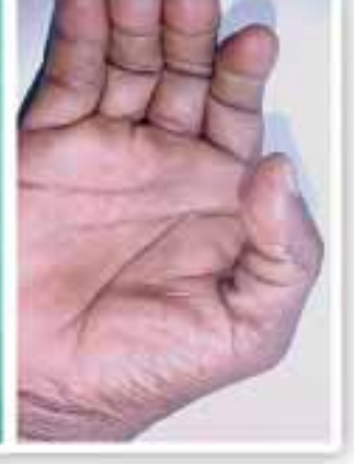
That is how his hand looked when he came for the Valedictory function of the project in Jan. 2002. He is doing the same job in the same company.