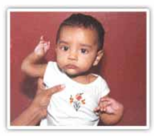
The right side after correction. The left side was also subsequently corrected. Many such surgeries are done under welfare programmes.