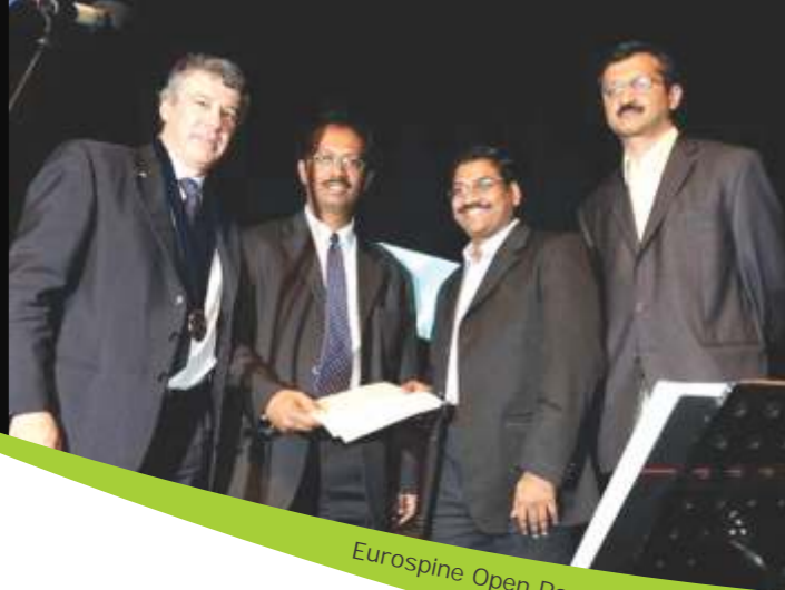
Eurospine Open Paper Award 2008