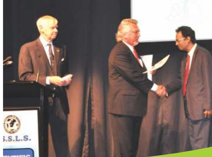
ISSLS Prize 2010