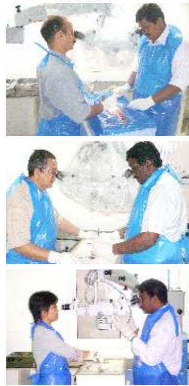
Trainees gaining skills in the wet-lab

The purpose of the course is to establish and strengthen the foundation of microsurgical skills in spine surgery. The course has two modules. In the clinical training module, the trainee spends two days in the operating theatre assisting and observing spinal microsurgeries along with other spinal instrumentation surgeries. In the lab module, the trainee is given hands-on training in the wet lab. The course is designed to benefit practising orthopaedic surgeons, spine surgeons and neurosurgeons by teaching them the nuances and techniques of basic microsurgical procedures like lumbar microdiscectomy, micro decompression, anterior cervical microdiscectomy, intra dural surgeries and repair of dural tears.