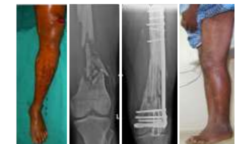
Grade IIIB Open comminuted fracture of distal femur with 13cm bone loss treated by single stage reconstruction with fibular strut graft and autografts.