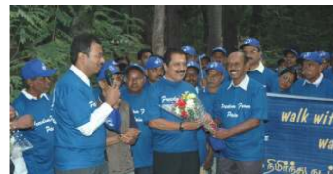
(Above) :Cine actor Sivakumar inaugurating the Walkathon 2009