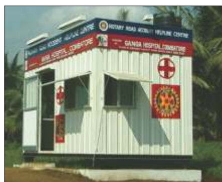
The Accident Helpline Center in Palaghat

Ganga Hospital in association with Rotary District 3200 has started Accident Help line centres at areas including Mavuthampathy, Kanjikode, Madhukarai by-pass and Palghat. The aim of these centres is to provide immediate aid to highway accident victims and transport them to the nearest hospital. Ambulances are stationed at all these centres, manned by the paramedical staff of Ganga Hospital. To date, 650 high-way road traffic accident victims have been resuscitated by these centres and transported for immediate specialist care.