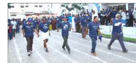
Patients who underwent joint replacement participating in a walk-race during Walkathon 2010