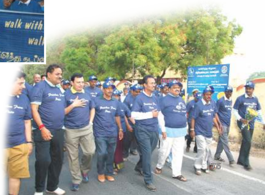
(Right) :Famous playback singer Padmashree Dr. S.P. Balasubramaniam inaugurating the Walkathon 2010