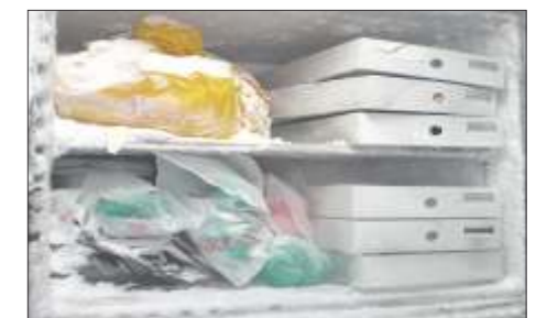
Fresh frozen allografts: Long bones with triple wrap and bone slices packed in PE boxes are stored after gamma irradiation