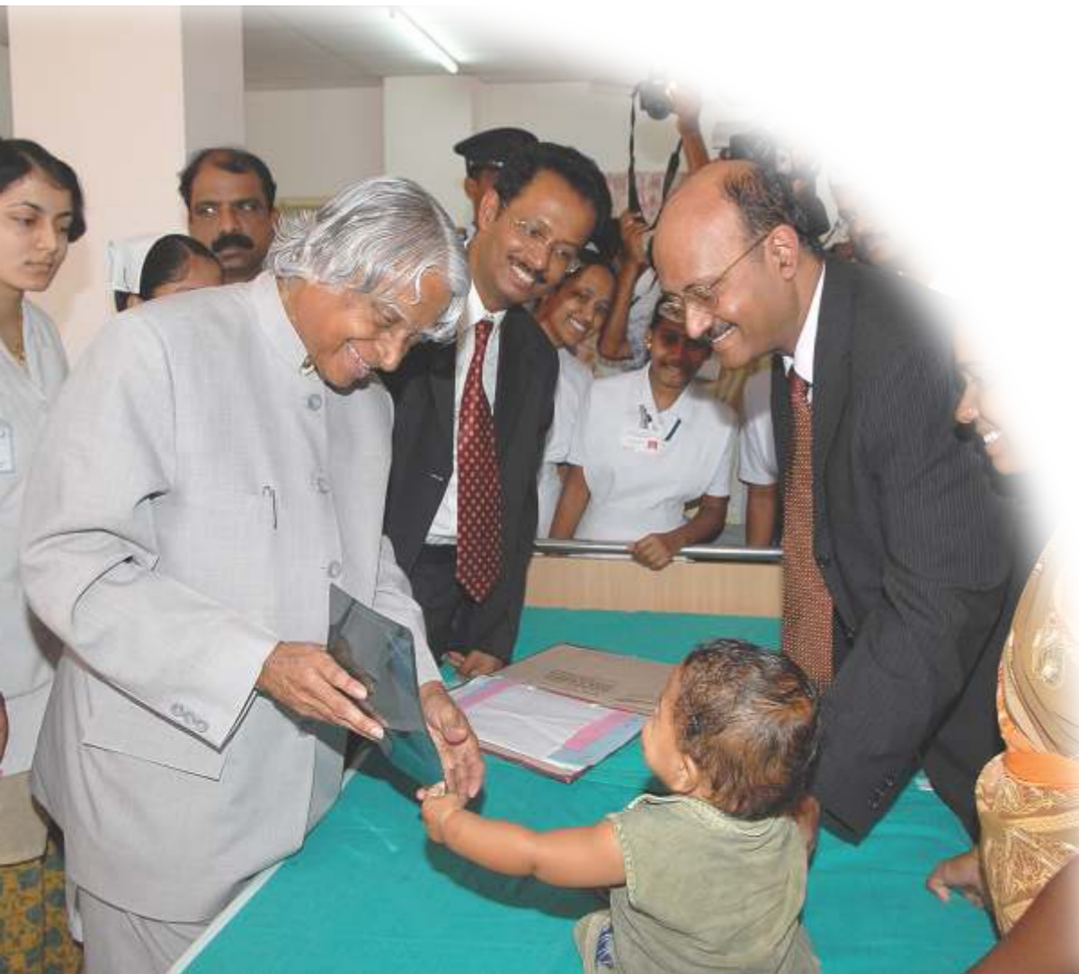
Dr APJ Abdul Kalam with a patient in the "SWASAM" ward during its inauguration on 3rd May 2008

Service to others is the rent we pay for the privilege of living on this earth